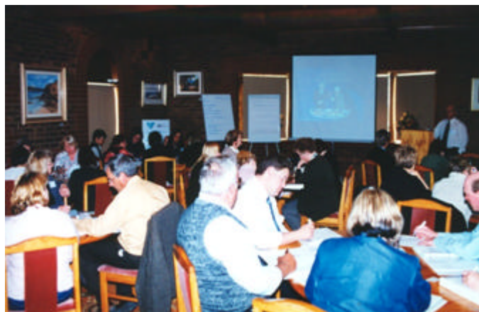
Attendees hard at work during the Corporate Governance seminar

At the completion of the one-day workshop all participants were given a Statement of Attendance (see Appendix 7) identifying the competencies they had completed. This is a requirement of Farmbis funding.