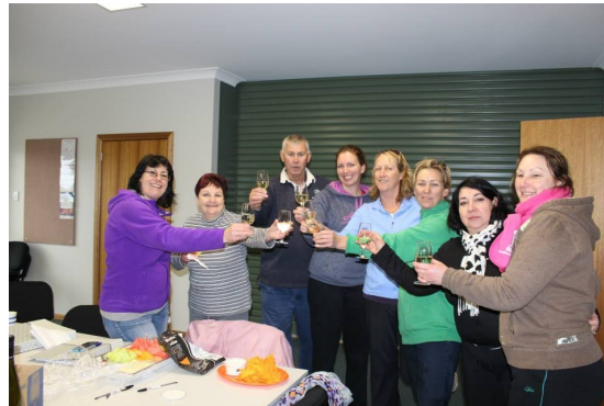
Board Induction Day 2013

Sponsorship support in 2014 has been at an all-time high, with 32 businesses supporting WiBRD through sponsorship. This has enabled us to continue to operate at a sustainable level.